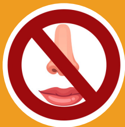
New Loss of Smell or Taste